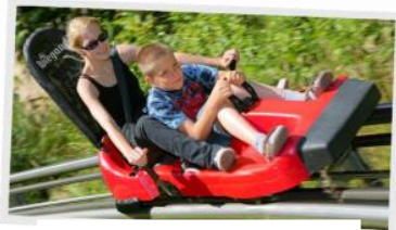
Mountain Coaster Rides

IN BEAUTIFUL Cortland, New York September 21-23, 2017