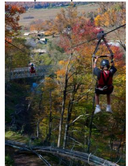
4 Amazing Zip Lines