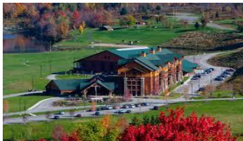
Resort Style Atmosphere