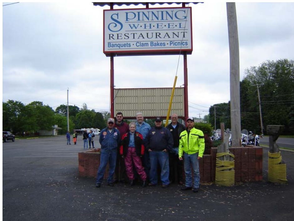
A little rain didn't keep Chapter D from participating in the Miracle Network Ride over Memorial Day weekend.