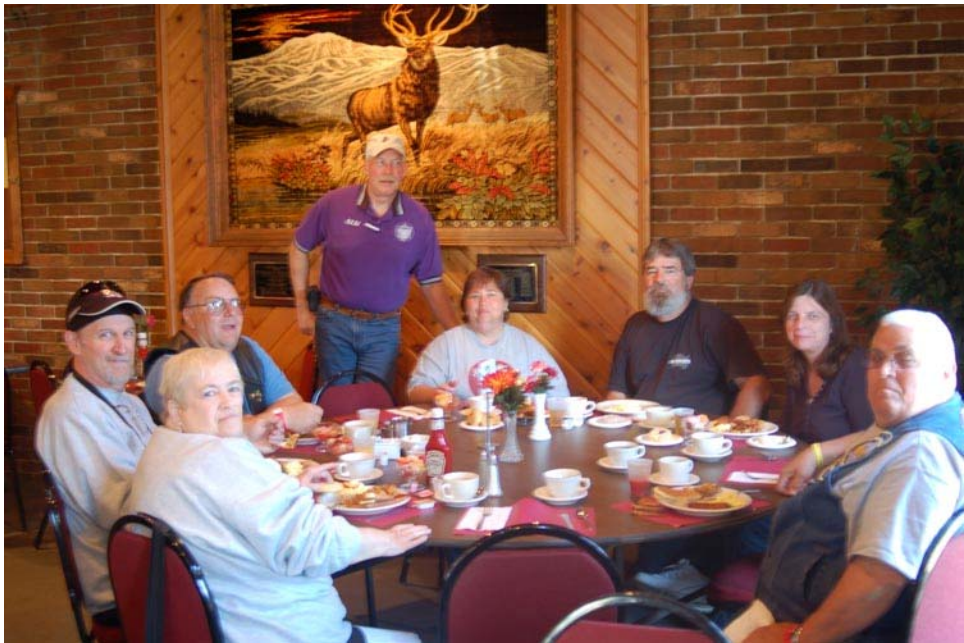
New York Chapter T made a great showing at the District Americade Breakfast.