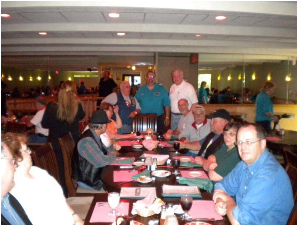
NY Chapter C joined over 100 other NY District GWRRA members at the Chapter L Gathering at Sweet Basil's Restaurant during Americade.