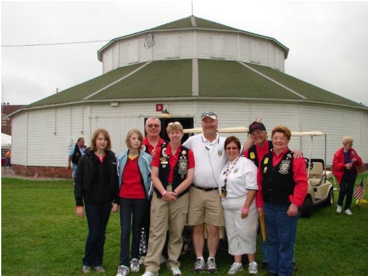
New York Chapter W took to the road to pick up some Dash for Cash points in Ohio. The Ohio District Rally was held in Wooster, Ohio, on June 12 – 13.