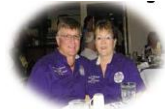
Region B ARL Coordinators NY District Membership Coordinator